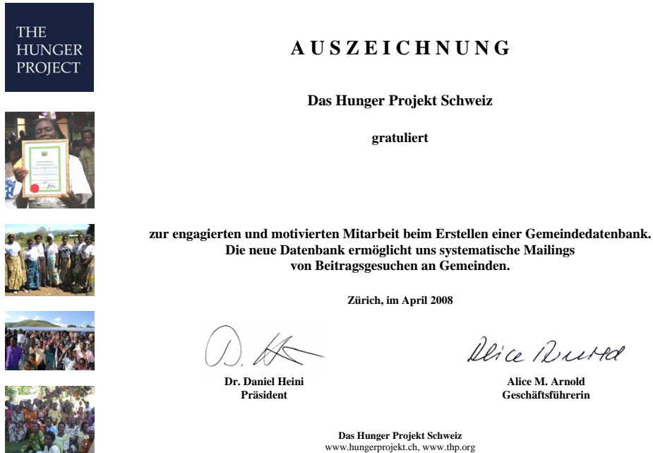
Figure 1: The Award Certificate

The text translates to "The Hunger Project Switzerland congratulates ... to his/her dedicated and motivated work in creating the community address database. This new database enables us to systematically approach communities with appeals for donations."